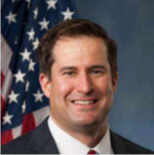
REP. SETH MOULTON D-MA