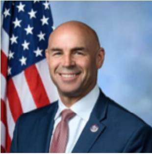
REP. JAKE ELLZEY R-TX VETERAN, U.S. NAVY

Congressman Jake Ellzey represents Texas’s 6th Congressional District, which encompasses southeastern areas of the Dallas/Fort Worth metropolitan area. After graduating from the United States Naval Academy, Ellzey served his country for 20 years as a helicopter pilot and fighter pilot in F-14s and F/A-18s. He concluded his military service as the Air Boss on the U.S.S. Ronald Reagan aircraft carrier. Ellzey was deployed nine times during his career, with five combat tours, including a ground tour supporting SEAL Team 5 in Iraq. He retired at the rank of Commander. After retiring from the military, Ellzey was a military contractor in Afghanistan, a small business owner, a commercial airline pilot, and a Commissioner on the Texas Veterans Commission. In 2020, he was elected to the Texas House of Representatives and won a special election in 2021 to represent the 6th District in Congress. In the 119th Congress, he is the Co-Chair of the For Country Caucus. He serves on the House Committee on Appropriations, where he is the Vice Chair of the Defense Subcommittee, and on the House Committee on Small Business, where he is the Chair of the Rural Development, Energy, and Supply Chains Subcommittee.