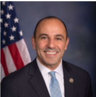
REP. JIMMY PANETTA D-CA