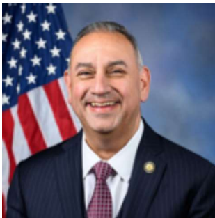
REP. GIL CISNEROS D-CA VETERAN, U.S. NAVY

Congressman Gil Cisneros represents California’s 31st Congressional District. Cisneros is the former representative for California’s 39th district from 2019-2021. Before his public service, he was a philanthropist and a non-profit leader, and served as a lieutenant commander in the United States Navy. After his first term in Congress, he served as the Under Secretary of Defense for Personnel and Readiness from 2021 to 2023 in the Biden Administration. In Congress, he serves on the House Committee on Armed Services and the House Committee on Small Business, where he is the Ranking Member of the Contracting and Infrastructure Subcommittee. He holds a bachelor’s degree from The George Washington University and two master’s degrees from Regis University and Brown University.