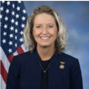
REP. JEN KIGGANS R-VA