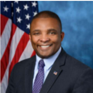
REP. DON DAVIS D-NC VETERAN, U.S. AIR FORCE

Chairman - Subcommittee on Rural Development, Energy, and Supply Chains