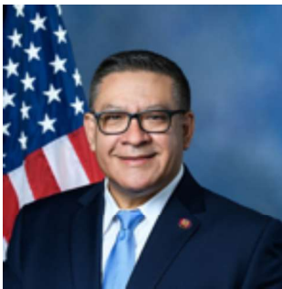
REP. SALUD CARBAJAL D-CA VETERAN, U.S. MARINE CORPS

Congressman Salud Carbajal represents the 24th Congressional District of California. He is a former Vice Chair of the For Country Caucus. He serves on the House Committee on Armed Services, the House Committee on Agriculture, and the House Committee on Transportation and Infrastructure, where he is the Ranking Member of the Coast Guard and Maritime Transportation Subcommittee. Carbajal served eight years in the United States Marine Corps Reserve, including active-duty service during the Gulf War in 1992 when he was mobilized to Jacksonville, North Carolina. Before his congressional service, Carbajal served on the Santa Barbara County Board of Supervisors for 12 years. He holds a bachelor’s degree from the University of California, Santa Barbara, and a graduate degree from Fielding University.