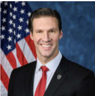
REP. PAT HARRIGAN R-NC