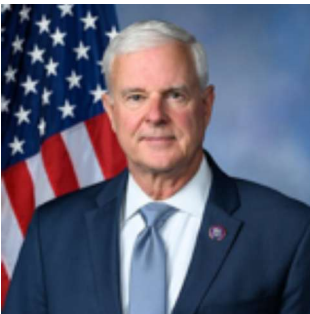
REP. STEVE WOMACK R-AR