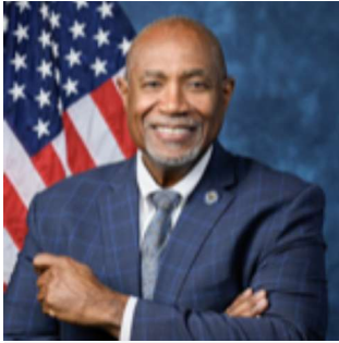
REP. HERB CONAWAY D-NJ VETERAN, U.S. AIR FORCE

Congressman Herb Conaway, MD represents New Jersey’s 3rd Congressional District. Dr. Conaway is a lifelong resident of Burlington County, New Jersey. Dr. Conaway received a bachelor’s degree from Princeton University, a medical degree from Jefferson Medical College, and a law degree from Rutgers Law School in Camden. After finishing his education, Dr. Conaway joined the United States Air Force, becoming a Captain in the Medical Corps at McGuire Air Force Base. There, he served as general medical officer and rose to assistant director of the primary care clinic during his four years of service. Dr. Conaway served the residents of the 7th Legislative District as a State Assemblyman for 25 years before his election to Congress in 2024. In Congress, he is a Vice Chair of the For Country Caucus and serves on the House Committee on Veterans’ Affairs, where he is the Vice Ranking Member of the committee, and on the House Committee on Small Business.