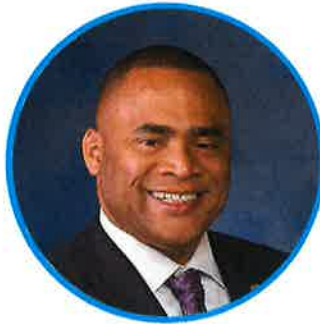
REP. MARC VEASEY D-TX-33