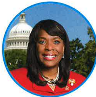
REP. TERRI SEWELL D-AL-07