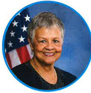
REP. BONNIE WATSON COLEMAN D-NJ-12