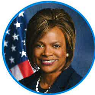
REP. VAL BUTLER DEMINGS