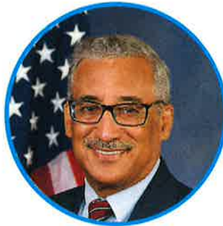
REP. BOBBY SCOTT D-VA-03