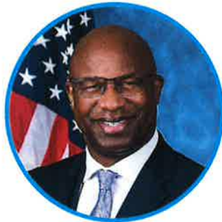
REP. JAMAAL BOWMAN D-NY-16