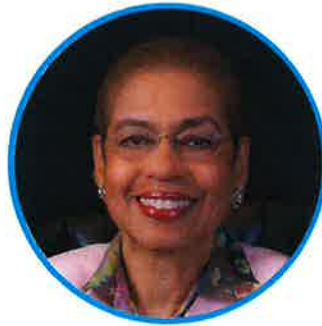
DEL. ELEANOR HOLMES NORTON D-DC