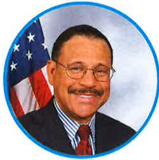
REP. SANFORD D. BISHOP