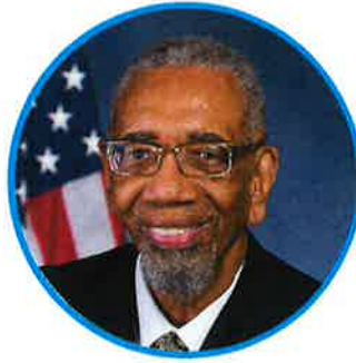
REP. BOBBY L. RUSH D-IL-01