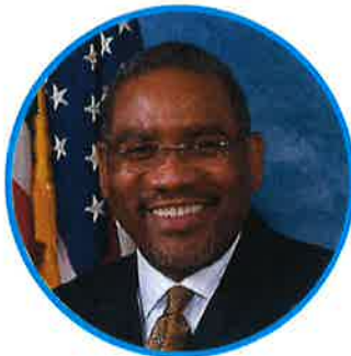
REP. GREGORY W. MEEKS D-NY-05