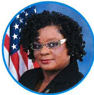
REP. GWEN MOORE D-WI-04