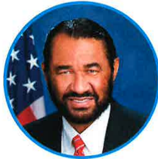
REP. AL GREEN D-TX-09