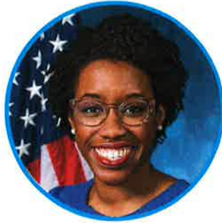
REP. LAUREN UNDERWOOD D-IL-14