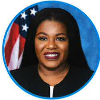
REP. CORI BUSH D-MO-01