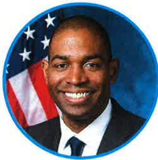
REP. ANTONIO DELGADO D-NY-19