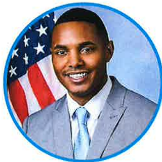
REP. RITCHIE TORRES D-NY-15