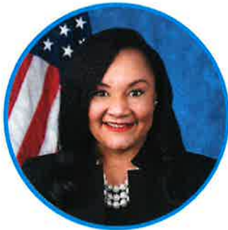
REP. NIKEMA WILLIAMS D-GA-05