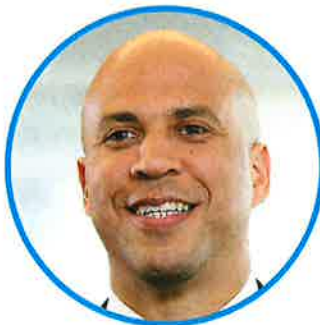
SEN. CORY BOOKER D-NJ