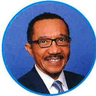
REP. KWEISI MFUME D-MD-07