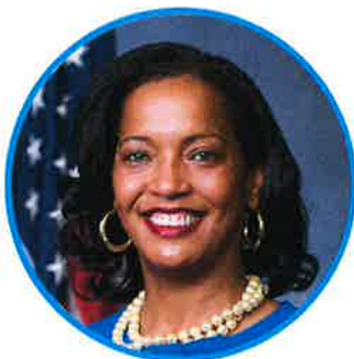
REP. JAHANA HAYES D-CT-05