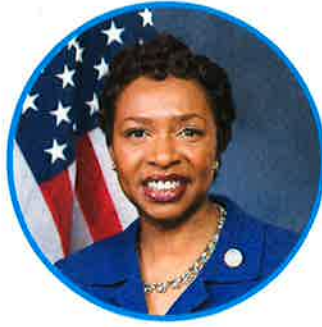
REP. YVETTE D. CLARKE D-NY-09