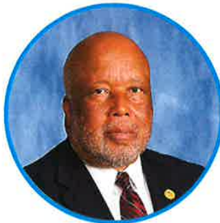
REP. BENNIE THOMPSON D-MS-02