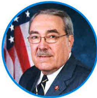
REP. G. K. BUTTERFIELD D-NC-01