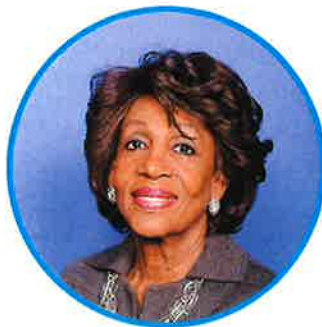
REP. MAXINE WATERS D-CA-43