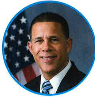
REP. ANTHONY BROWN