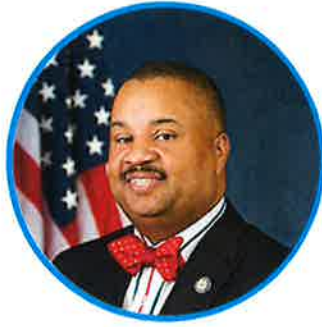
REP. DONALD M. PAYNE, JR. D-NJ-10