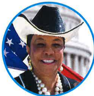
REP. FREDERICA S. WILSON D-FL-24