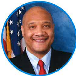
REP. ANDRÉ CARSON D-IN-07