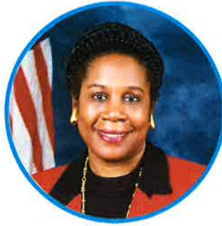
REP. SHEILA JACKSON LEE D-TX-18