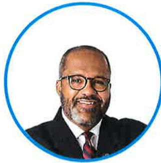
REP. TROY CARTER D-LA-02