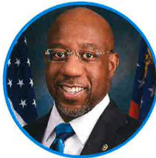
SENATOR RAPHAEL WARNOCK State of Georgia