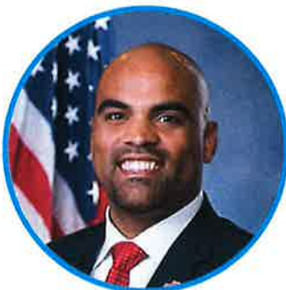
REP. COLIN ALLRED