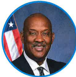
REP. DWIGHT EVANS D-PA-02