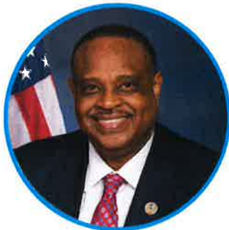
REP. AL LAWSON