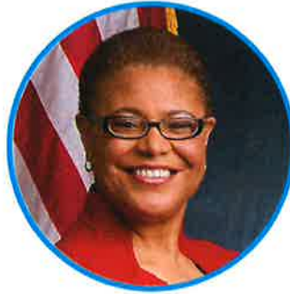
REP. KAREN BASS D-CA-37