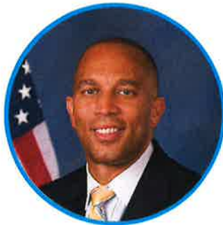
REP. HAKEEM JEFFRIES D-NY-08