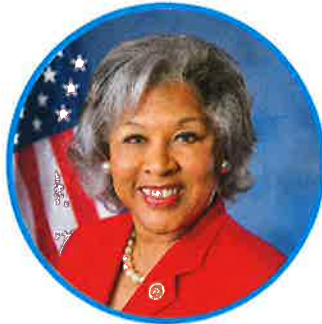
REP. JOYCE BEATTY D-OH-03