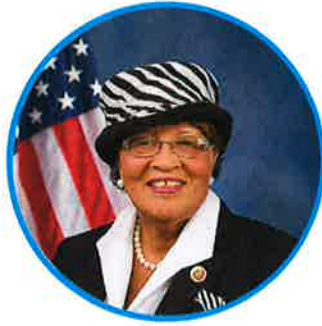
REP. ALMA ADAMS D-NC-12