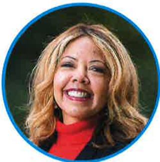
REP. LUCY MCBATH D-GA-06