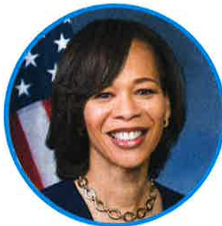
REP. LISA BLUNT ROCHESTER D-DE