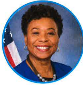
REP. BARBARA LEE D-CA-13