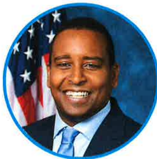
REP. JOE NEGUSE D-CO-02