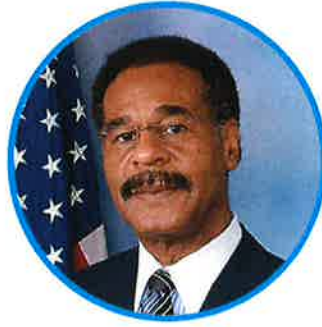
REP. EMANUEL CLEAVER, II D-MO-05