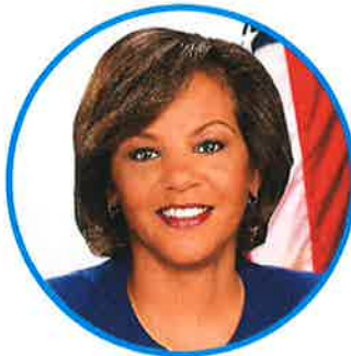
REP. ROBIN KELLY D-IL-02