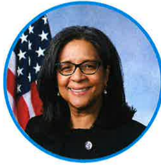
REP. MARILYN STRICKLAND D-WA-10