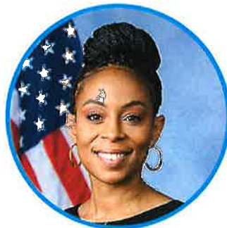
REP. SHONTEL BROWN D-OH-11