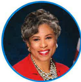
REP. BRENDA LAWRENCE D-MI-14