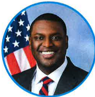
REP. MONDAIRE JONES D-NY-17