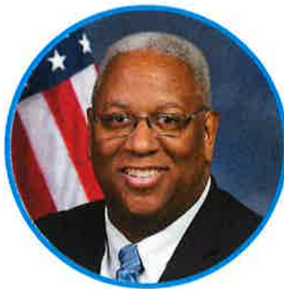
REP. A. DONALD MCEACHIN