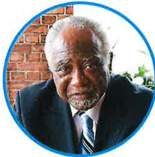
REP. DANNY K. DAVIS D-IL-07