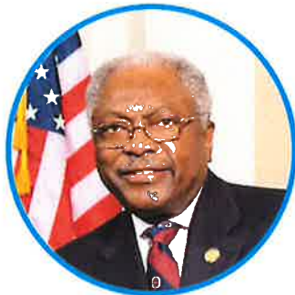
REP. JAMES E. CLYBURN