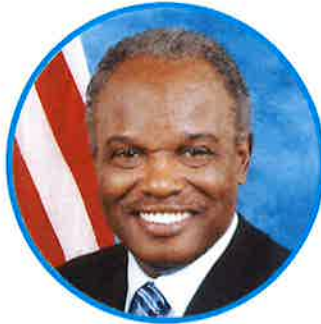
REP. DAVID SCOTT D-GA-13