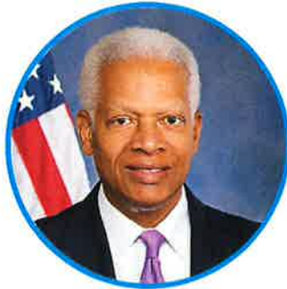
REP. HANK JOHNSON D-GA-04