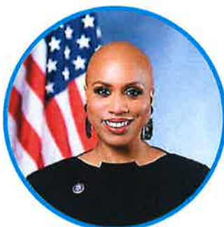
REP. AYANNA PRESSLEY D-MA-07