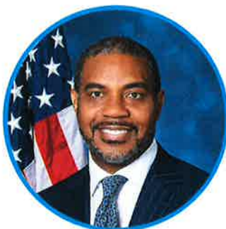
REP. STEVEN HORSFORD