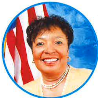
REP. EDDIE BERNICE JOHNSON